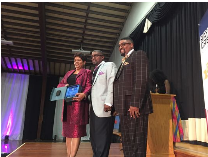
Members of the Bible Tabernacle Christian Center accept the Ray Crenshaw neighborhood award for best church choir Saturday night at the Voni Grimes gym in York.

Best church choir: Bible Tabernacle Church Choir