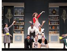
Shrek and Annie at Germantown High Schools This We... March 18, 2016