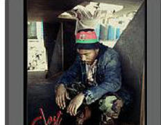
Germantown Based Hip-Hop Artists Release New Album March 18, 2016