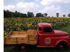
Butler's Orchard Announces Day Pass Fee, Additiona... March 16, 2016