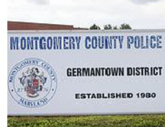
Leggett's Proposed Budget Means More Cops for Clar... March 17, 2016