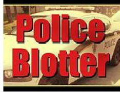
Police Arrest Man After Attempted Armed Robbery in... March 18, 2016